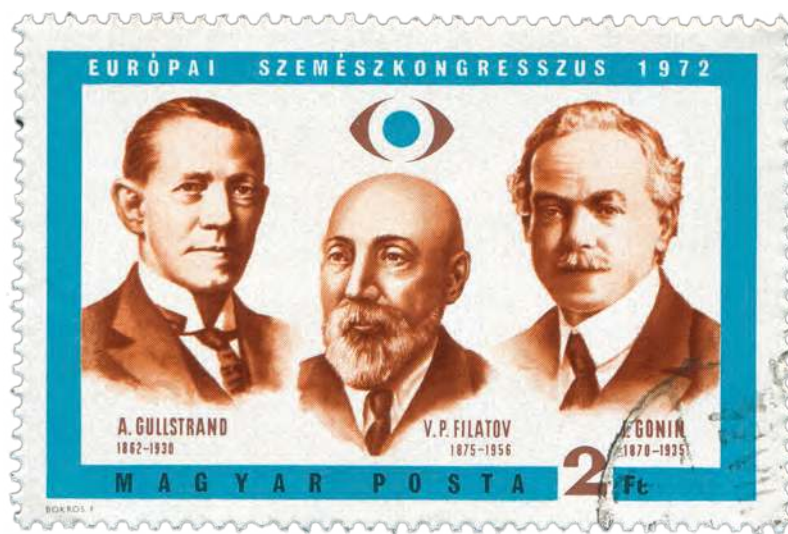
Hungarian stamp with Allvar Gullstrand, Wladimir Filatov, and Jules Gonin