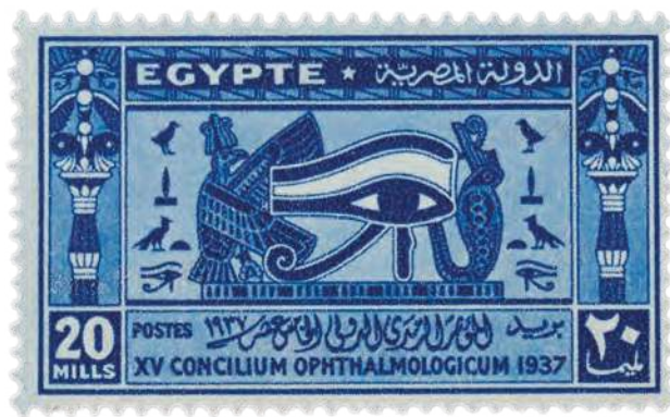
Stamp commemorating the 15 th International Congress of Ophthalmology in Egypt in 1937.