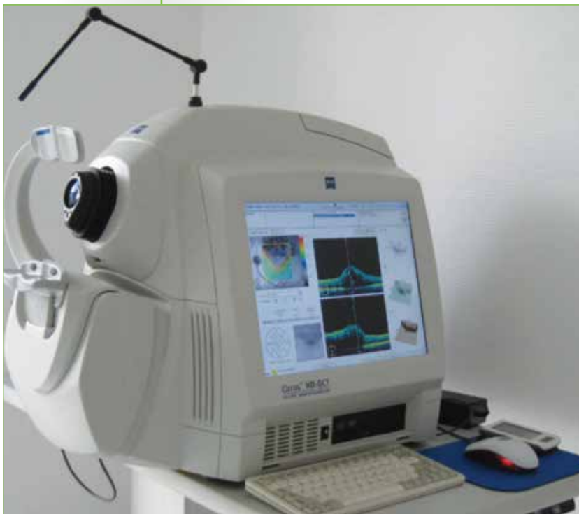
Cirrus™ HD-OCT (Carl Zeiss)

OCT is advancing so quickly that it is impossible to clearly define its use profile, and any document is certain to become obsolete quite quickly. Currently indispensable for analysing the retina, it is becoming so for glaucoma and other optic neuropathies. This little book aims to simply give an update on OCT in glaucoma and pathologies of the optic nerve. The first chapter concerns the principles and interpretation of OCT and has a purely practical function, to help the reader understand the results. Glaucoma is obviously an important part of this book, but one part is devoted to other eye diseases and especially neuro-ophthalmological diseases, because they can mimic glaucoma or be a source of confusion if they are also present. Regardless of this facet of differential diagnosis, OCT has acquired its place in the evaluation of the optic nerve in general.